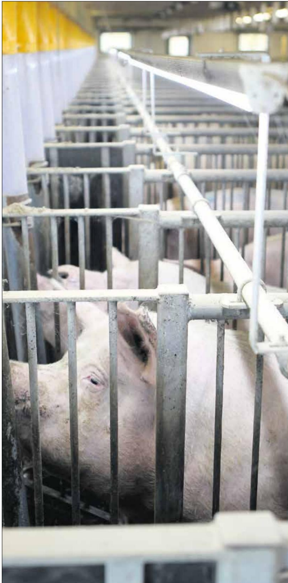
LED lighting in a pig barn can have a positive impact on productivity, several customers who have installed the lighting say.